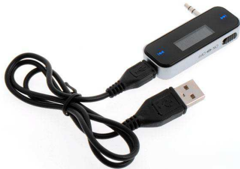
1 x USB Cable